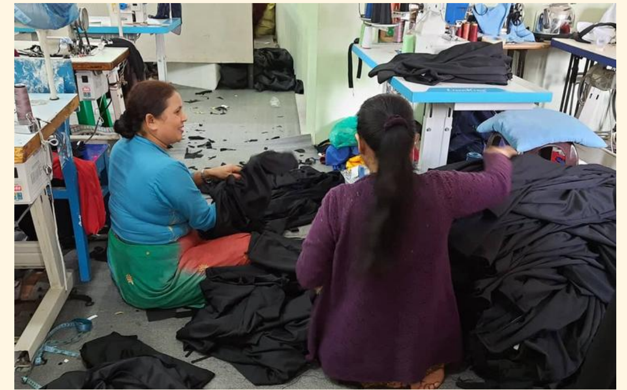
Tailoring training, Kathmandu. During the pandemic and post pandemic