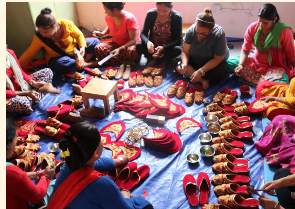
Shoes-making training kavre