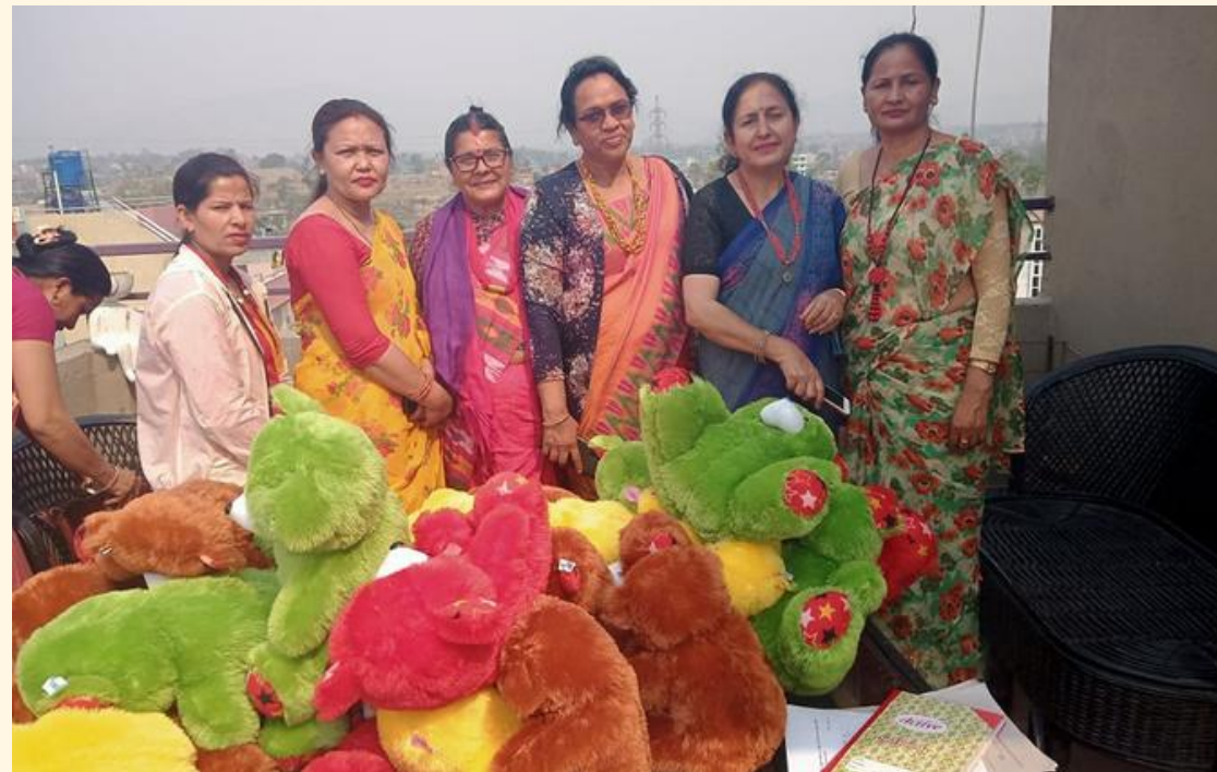
Knitting & sewing training Bhaktapur