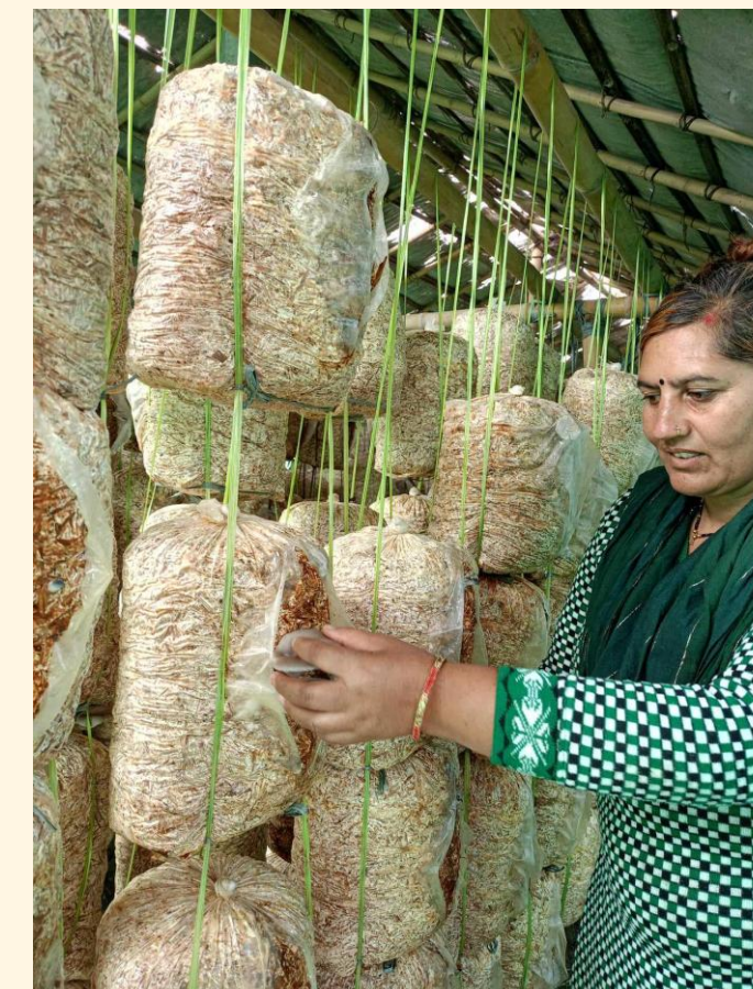
Mushroom farming in Bhaktapur