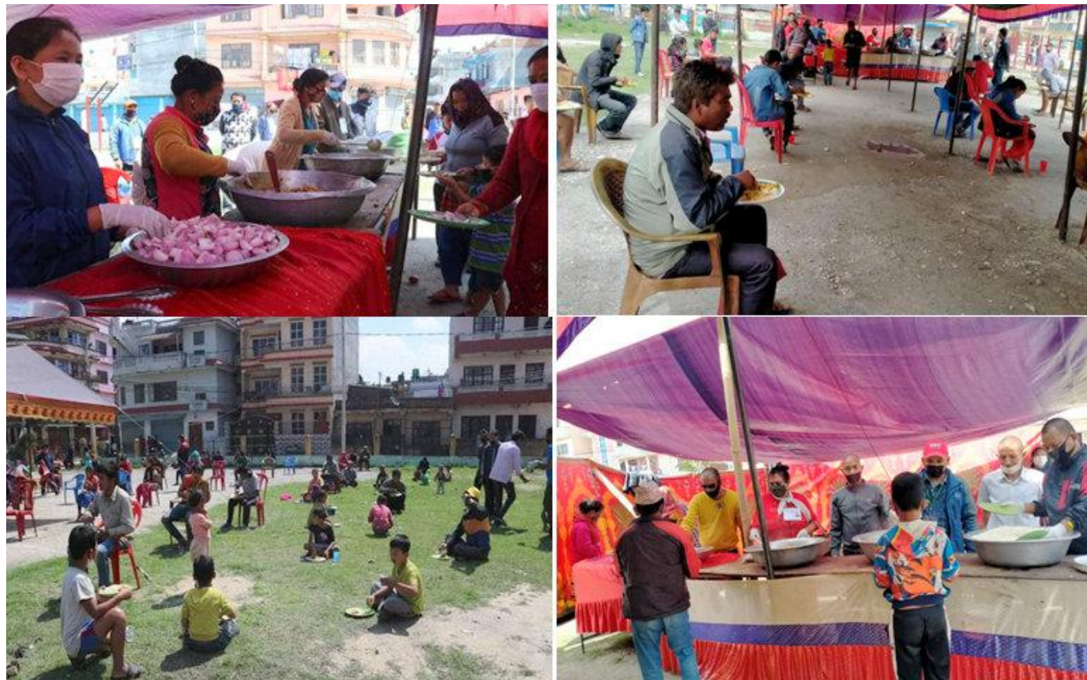
LOCKDOWN 2020 FOOD DISTRIBUTION