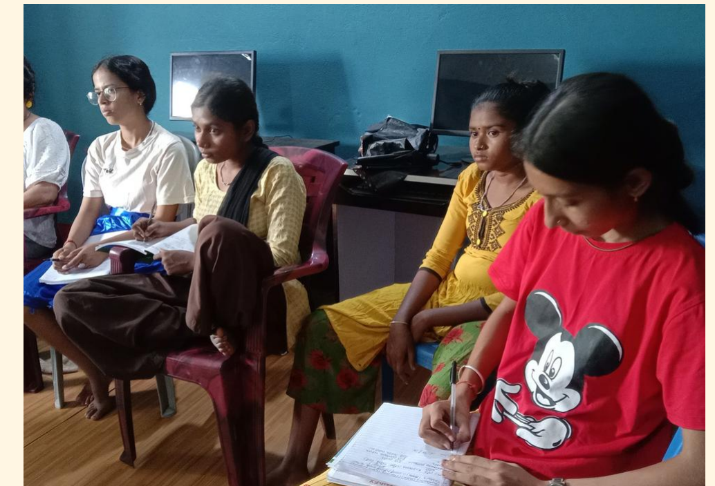
Computer training Jhapa. This training was held in 2 different phases.