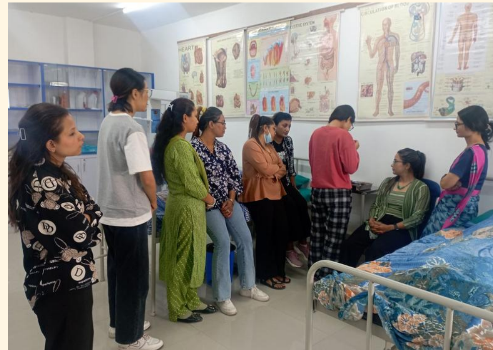
Personal Support worker training (Sunsari & Kathmandu)