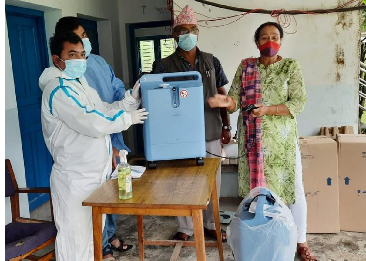
DISTRIBUTION OF OXYGEN CONCENTRATOR DURING LOCKDOWN