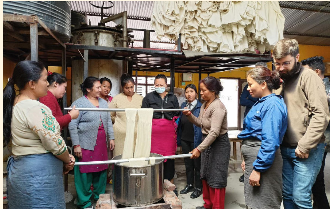
Natural coloring training, Kathmandu The training was held in 3 different phases.