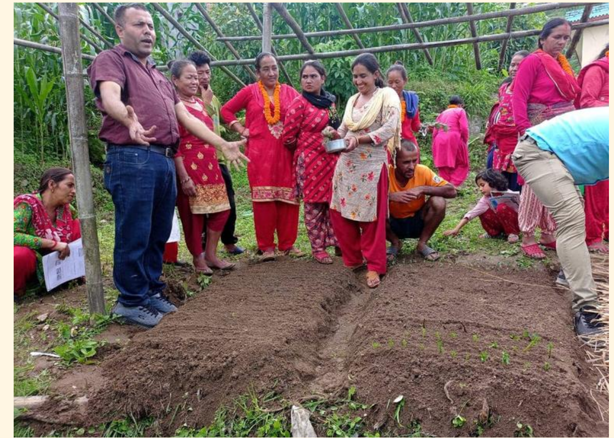
Floriculture training in Sindhupalchowk for rural women.