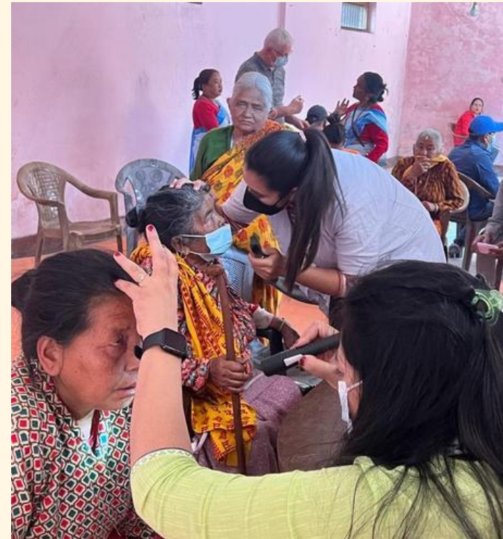
EYE CARE SERVICES

A successful free eye camp in Kathmandu and Kavre district, serving over 1204 individuals with vital eye care services, treatment, and eyeglasses. The camp aimed to provide free eye care services to poor people, old age individuals, and those with cataract problems.